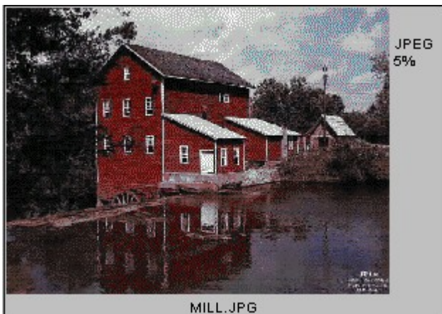
Largest thumbnail display size after image is regenerated.

MediaPaq features fourteen display sizes for the thumbnail images in the main view window. You can adjust each media library for the best viewing size; the library will retain that size until you change it. If you resize the image, the quality of the display will degenerate with each size change. To restore the quality of the thumbnail image display, select the desired image(s) and then select the Regenerate button in the ToolBar.