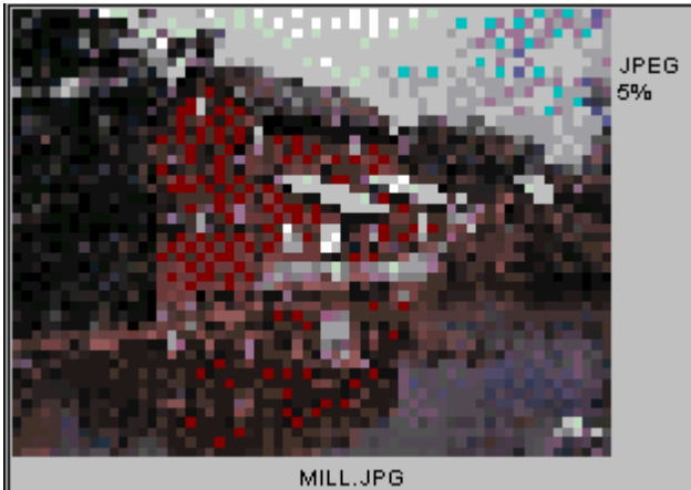
Largest thumbnail display size before image is regenerated.