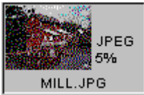
Smallest thumbnail display size at 640 x 480 screen resolution.