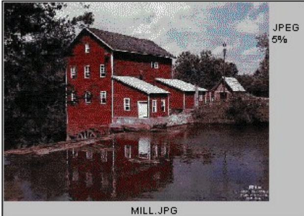
Largest thumbnail display size at 640 x 480 screen resolution.

MediaPaq features fourteen display sizes for the thumbnail images in the main view window. You can adjust each media library for the best viewing size; the library will retain that size until you change it.